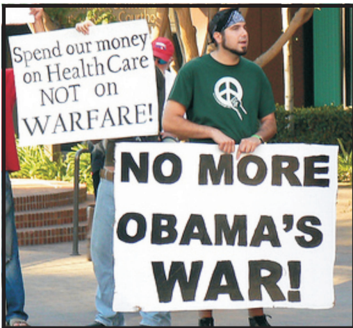
Demonstrators on 8th Anniversary of the first bombing of Afghanistan, October 2009

The PRC has also supported the Amnesty International "Walk for Human Rights," October; Vigil at the Border commemorating the fall of the Berlin Wall and calling attention to the Triple Fence at the US/Mexico border; the annual Martin Luther King Breakfast and other events. The PRC and members have