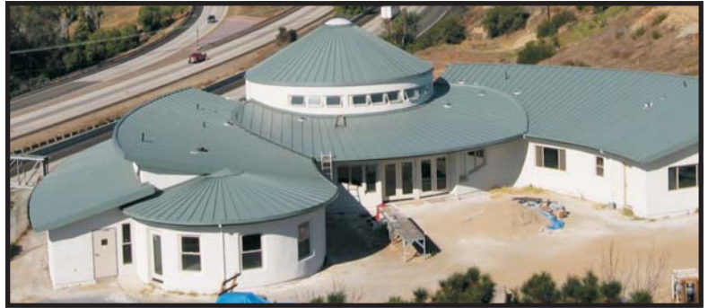
Exterior View of Friends Center November 2008

The Friends Center is a collaborative effort of the Peace Resource Center, the First Church of the Brethren, the San Diego Friends Meeting, and the American Friends Service Committee, San Diego Area. It will be an enduring visual statement of our dedication to advancing peace, social justice and spiritual growth. As an environmentally-sound "green" building, it will be a witness to our commitment to wise stewardship of the earth's resources. Built and operated in collaboration, the building will daily demonstrate how organizations with common values can share resources and work together to create new models for social change. (See the building website at www.sdfriendscenter.org for more info.)