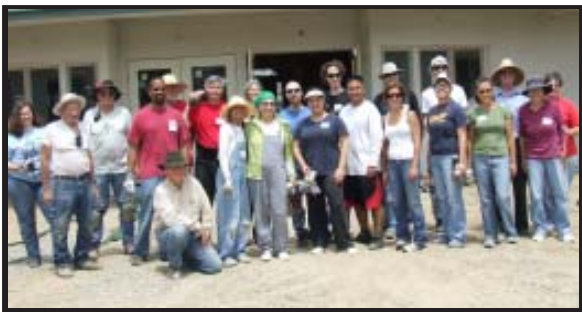
Annual Work-a-thon for Peace & Justice May 2009

"Gardeners 4 Peace," a group of volunteers who came together to take care of our permaculture garden, continue their efforts. In addition to weeding and taking care of the fruit trees, they have started an active program of composting on the property and composting workshops have been held. The mulch waddles they made last year are amazingly successful at holding water on the property. The trees are bearing delicious fruit; come by some time and sample the "fruits" of their labor. To help or for info on gardening and composting workshops, contact them at gardeners4peace@hotmail.com