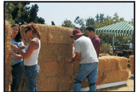
Volunteers at work constructing the courtyard's rice straw bale wall at this year's Work-a-thon for Peace & Justice.

In keeping with a "green" building approach we have chosen bamboo for the interior woodwork—sills and surrounds for doors and windows and for the sound damping louvered wainscot in the meeting room. At each step in the construction process we have sought to add innovations that will enhance the performance and beauty of this architecturally significant San Diego building. Thanks to generous contributions we have been able to accomplish much in this past year. Though substantial work remains we should complete our building some time in 2010.