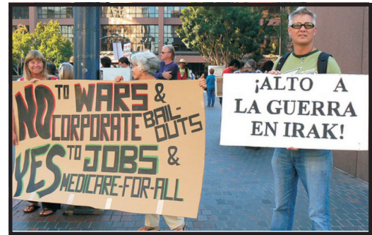
Demonstrators on 8th anniversary of the first bombing of Afghanistan, October 2009

and Justice. Since its formation, just days after the attacks, the coalition has been an important voice for uniting people in San Diego who are opposed to the Bush Administration's drive to