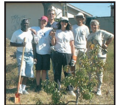
West Orchard Work Crew October 2006

In addition to our initial permaculture projects, another large area has been graded for a third permaculture area! Irrigation lines are being laid and we have about half the trees needed to fill this new slope. We hope the rest will be donated soon by some kind “Nursery for Peace.” Last year’s permaculture is thriving, with many enjoying the “fruits” of their labor. Our permaculture effort has been greatly enhanced this year by the formation of “Gardeners for Peace,” a group of volunteers who have come together to take care of the plants. To help, contact them at gardeners4peace@hotmail.com .