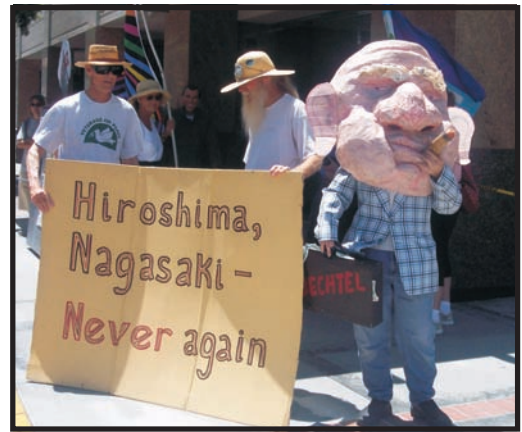
Nagasaki Day Demonstration outside Bechtel Corporation's San Diego office August 2006

After a two-year hiatus, we resumed our annual High School Peace Writing Contest for the 2005-2006 school year. This important project gives young people, grades 9-12, the opportunity to contribute their solutions to problems facing our world. The 10 winning entries are available in booklet form on our website: www.prcsd.org . Our topic for the 2006-2007 school year is "What Can My Generation Do To Help Create a Peaceful World Free of War and Violence?"