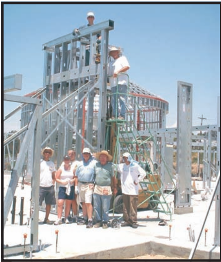
San Diego Peace Corps Association Work Party July 2006

In 2006, we moved into Phase II of our construction project. As 2006 comes to a close, we’re proud to announce that we have completed the Friends Center’s load-bearing portion of the frame, using donated light-gage steel. As you can see, the building is really taking shape!