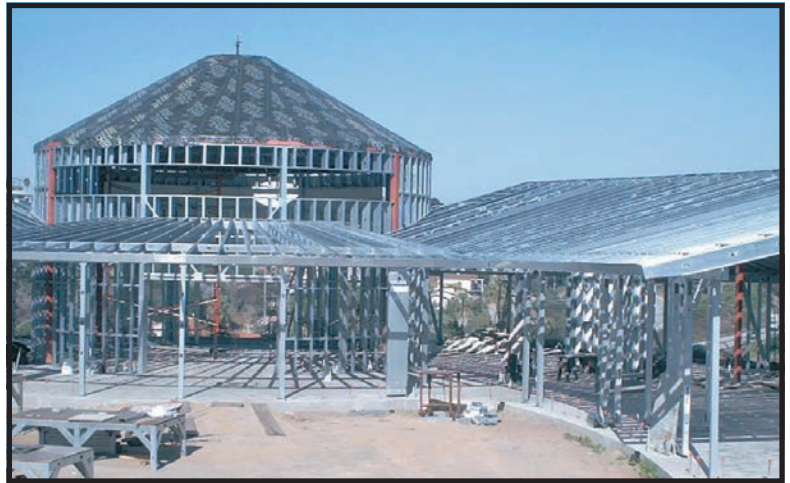
Progress to date, December 2006

The Friends Center is a collaborative effort of the Peace Resource Center, the First Church of the Brethren, the San Diego Friends Meeting, and the American Friends Service Committee, San Diego Area. It will be an enduring visual statement of our dedication to advancing peace, social justice and spiritual growth. As an environmentally-sound “green” building, it will be a witness to our commitment to wise stewardship of the earth’s resources. Built and operated in collaboration, the building will daily demonstrate how organizations with common values can share resources and work together to create new models for social change. (See the building website at www.sdfriendscenter.org for more info.)