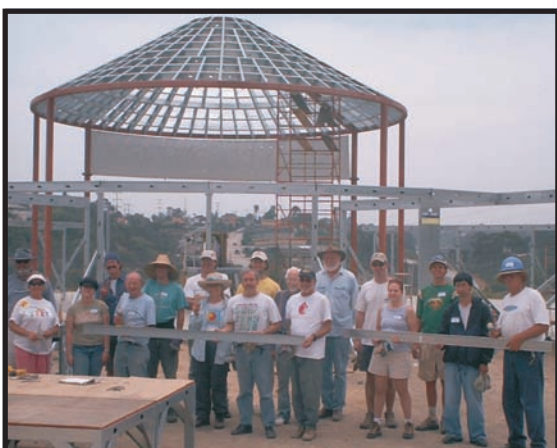
Annual Work-a-thon for Peace & Justice June 2006

We had been building with all volunteer labor, but received a donation this year to hire two construction apprentices to help our three permanent volunteers. They started working toward the end of the year. We continue to have the help of regular and occasional volunteers. So far there have been over 150 volunteers helping with this project, including individuals on regular, part-time schedules and groups like the annual Work-A-Thon sponsored by the PRC and Project Yano, the San Diego Buddhist Peace Fellowship, the Unitarian Universalist Church in Hillcrest, UCSD’s Engineers Without Borders, and the San Diego Peace Corps Assoc. If you or a group you work with would like to be on our volunteer list and receive e-mail notices of building progress and volunteer opportunities, please contact us.