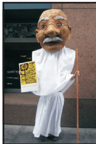
Declaration of Peace Week activities included this puppet created by the S.D. Puppet Insurgency

Some of the events on which we worked with the coalition to help organize include: Peace Contingent in the Annual Martin Luther King Parade, Jan. 15; Anti-War Rally and Peace Festival on the third anniversary of the Iraq War,